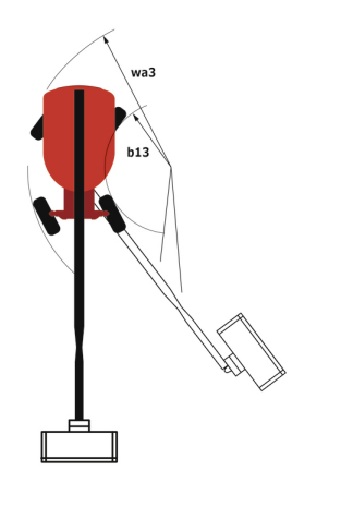
220 TJ+ - Dimensional drawing