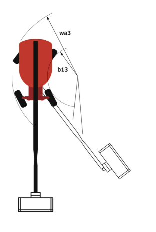
220 TJ+ - Dimensional drawing